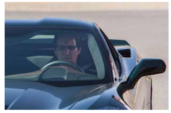
"It's the goal of every instructor here to make sure everyone leaves with not just a great experience, but a knowledge base that will take them forward and make them better drivers...and you can apply that just about anywhere you go."