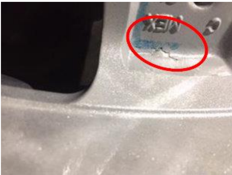
Back Side of Spoke: