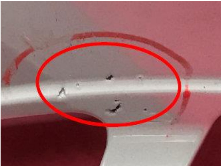
Back Side of Spoke near Rim: