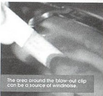
The area around the blow-out clip can be a source of windnoise.

You can adjust the tip-in using the jack screw. A counterclockwise adjustment increases tip-in, and clockwise decreases. Refer to the service manual for more information on tip-in