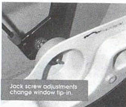
Jack screw adjustments change window tip-in.

rear of the door glass, you may need to adjust the window tip-in. The glass should be flush, to 2 mm under flush, to the B-pillar retainer.