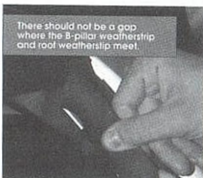
There should not be a gap where the B-pillar weatherstrip and roof weatherstrip meet.

The next three checks do not appear in the service manual update,