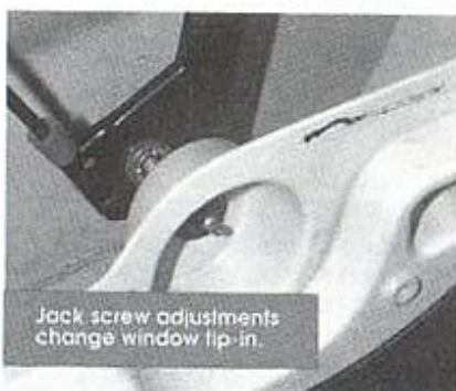
Jack screw adjustments change window tip-in.

rear of the door glass, you may need to adjust the window tip-in. The glass should be flush, to 2 mm under flush, to the B-pillar retainer.