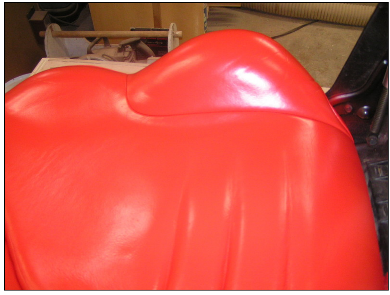
Seat bottom after re-dye.